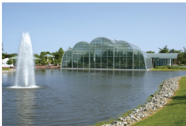
Above and near right: Butterfly House at Faust Park in Chesterfield. Far right: Kemper Demonstration gardens at MO Botanical Garden.

Opera www.opera-stl.org Symphony www.slso.org Repertory theatre www.repstl.org Black Repertory www.theblackrep.org Fox www.fabulousfox.com Outdoor Theatre www.muny.org U of Missouri www.touhill.org Movies www.stlouiscinemas.com Performing Arts for all ages www.cocastl.org Dance www.dancestlouis.org Washington U www.edisontheatre.wustl.edu Concert www.sheldonconcerthall.org Musical Theatre www.stagesstlouis.org