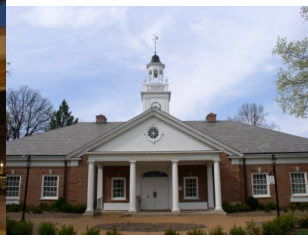
Far left: Clayton at night, Near left: Ladue City Hall